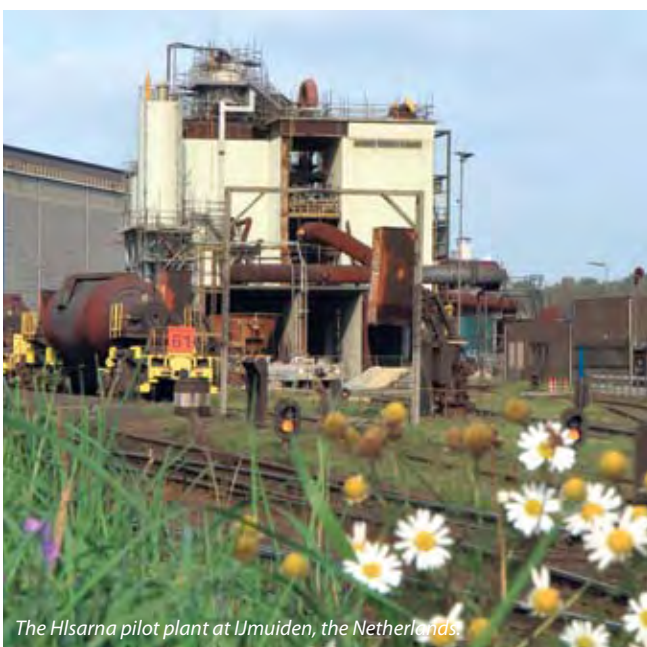
The Hlsarna pilot plant at IJmuiden, the Netherlands.

Tata Steel has, in partnership with Dyesol, developed the world's largest dye-sensitised photovoltaic module, a big step in the development of micro-energy generation within buildings. The partnership successfully produced hundreds of metres of printed steel and polymer film, establishing the feasibility of a continuously printed dye-sensitised product.