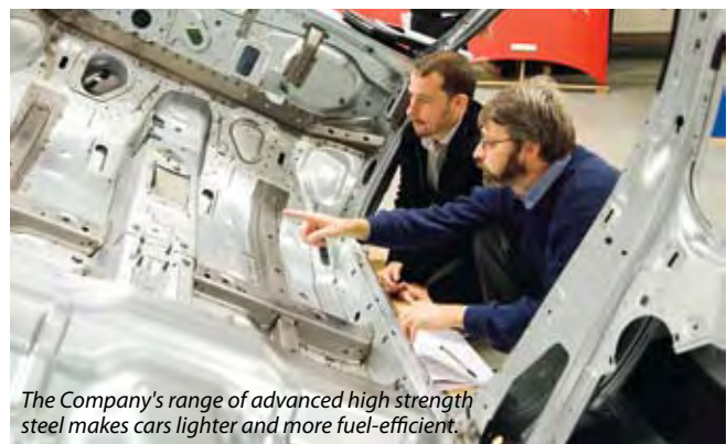
The Company's range of advanced high strength steel makes cars lighter and more fuel-efficient.

Outcomes from the Gate-to-Gate analysis conducted for the coke plant at Jamshedpur in 2010-11 is expected to reduce the overall emissions from the coke plant by 20%. LCA projects on coal mining and washing, conducted at West Bokaro and Jharia in 2003 and 2006, led to the recycling of rejects, greater conservation of natural resources and a drop in emissions of various polluting gases. The LCA study for cold roll sheets conducted in 2004 prompted improvements in gas recovery from the