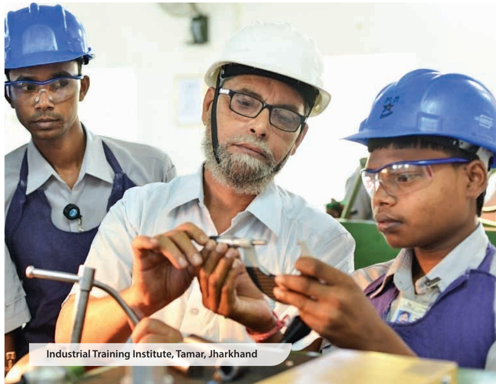
Industrial Training Institute, Tamar, Jharkhand

Tata Steel's Noamundi and Joda East mines have received a five-star rating from the Government of India for sustainable mining.