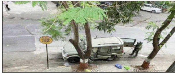
A vehicle laden with explosives was found outside Antilia early this year