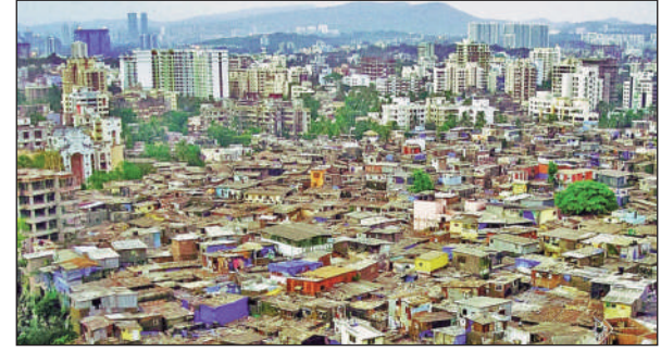
The civic body said most slums violate guidelines by adding more floors

"We have issued notices to more than 300 owners, who have illegal extensions of