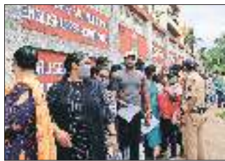
People queue up to get inoculated at a vaccination centre in Mumbai on Thursday. Ganesh Shirsalkar

Kapadia had submitted additional suggestions for effective improvement of the state government's policy for home vaccination of beneficiaries. The suggestions include effective monitoring of all beneficiaries for 48 hours post-vaccination at home and development of an application in which the medical history of the beneficiary can be