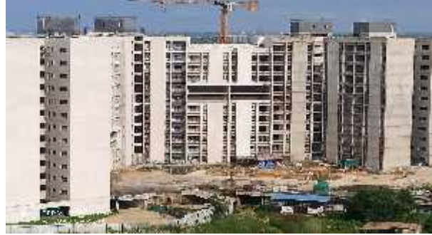
Construction of building in progress