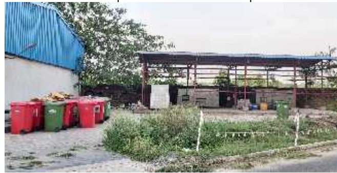
Organic waste composting machines are in operation