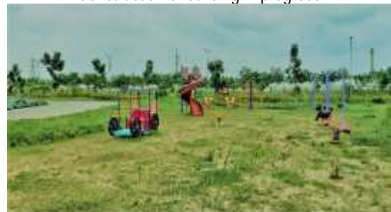
Children's park inside residential complex