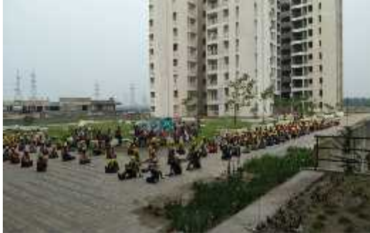
Podium area is functional