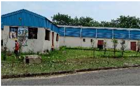
1000 KLD Sewage Treatment plant in operation