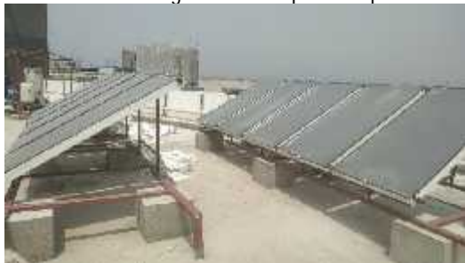
Solar Panels installed at roof top of High rise buildings