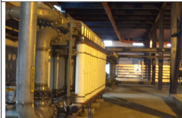
Reverse Osmosis Plant