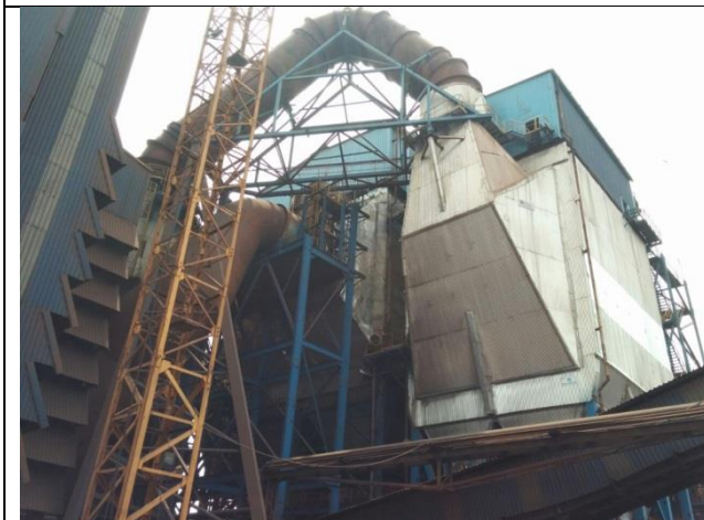
Sinter Plant 3 New Waste Gas ESP