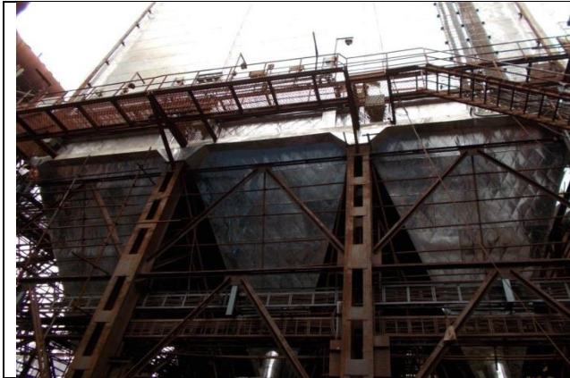
Sinter Plant 1 Waste Gas ESP