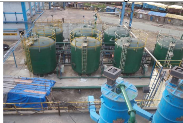
Side stream filter of CETP