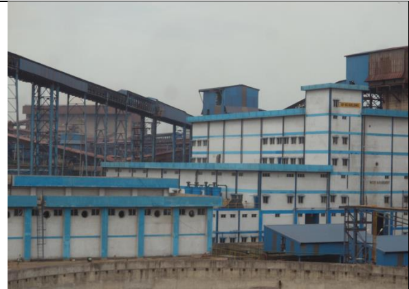
Reverse Osmosis Building