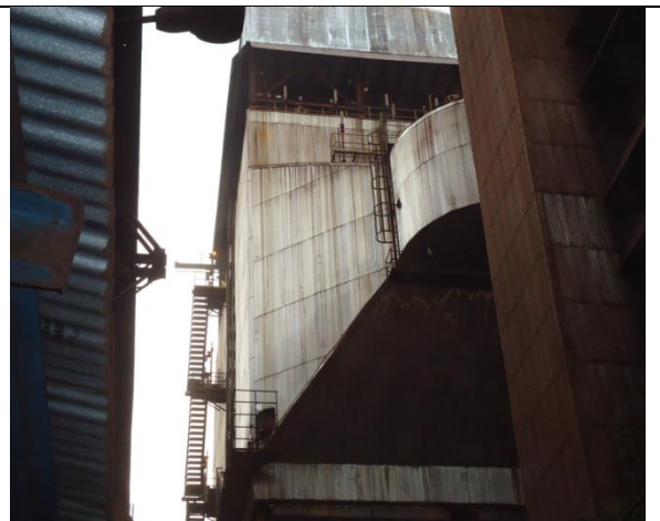
Sinter Plant 2 New Waste Gas ESP