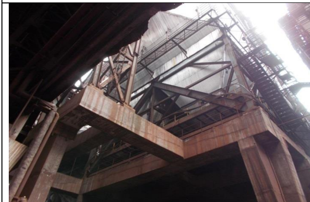
Sinter Plant 2 Refurbished ESP