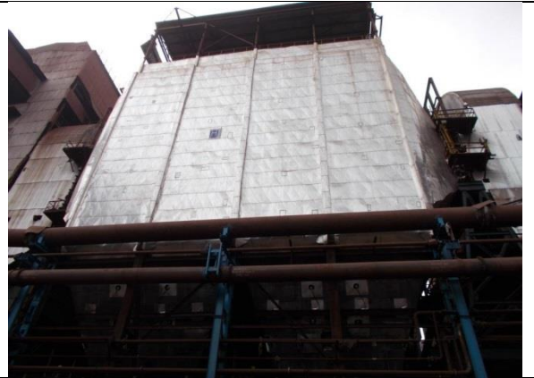
Sinter Plant 2 Waste Gas ESP