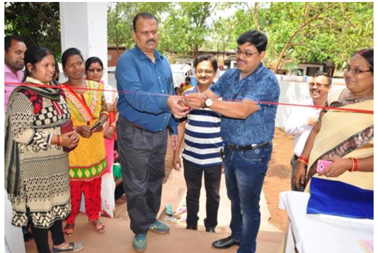
Medical camp at Bichakundi dispensary on Oct'17