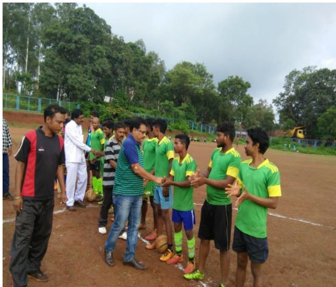
Football tournament at Bichakundi

Every year we organise inter-village tournament in Bichakundi peripheral areas. This year 12 teams and 100 players participated in the tournament. The program provides an opportunity for the under privileged talents of the villages to show case their skills and talent. These youths prove to become role models to the younger generations. At the same time it allows us to meaningfully engage the young generation thus preventing them from getting indulged in unhealthy means of recreation.