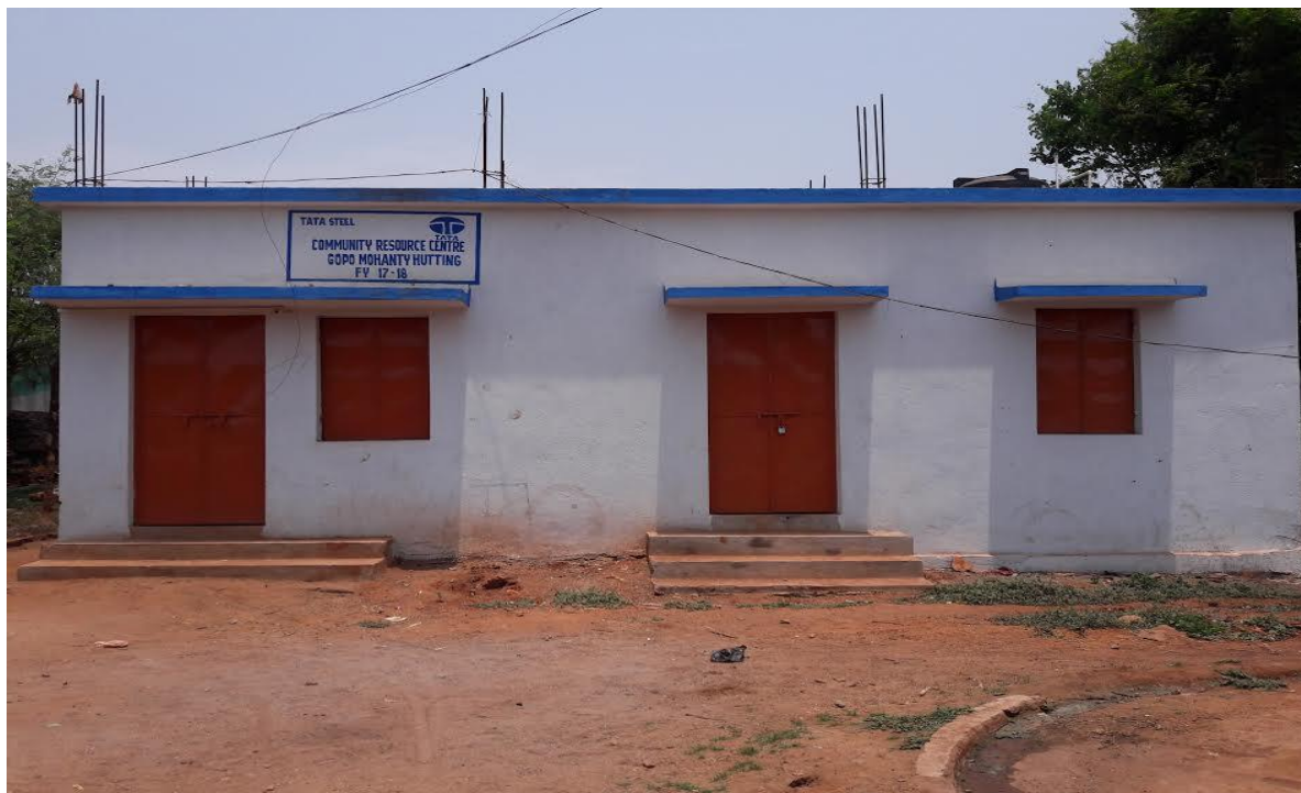
Construction of CRC at Gopo Mohanty Hutting..