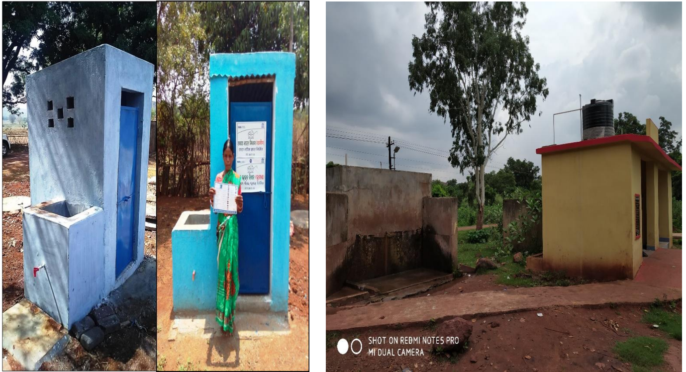
Construction of 26 Nos IHL Toilet in Kundrupani area.

To realize Gandhiji's dream of a clean India, Govt. of India launched "Swachh Bharat Mission" with effect from 2nd October 2014. It aims to achieve Swachh Bharat by 2019, as a tribute to the 150th Birth Anniversary of Mahatma Gandhi. The National Flagship Program for sanitation i.e. Nirmal Bharat Abhiyan has been restructured and renamed as "Swachh Bharat Mission"(Gramin). The concept of Swachh Bharat encompasses ways to access every person with sanitation facility toilets and provision of adequate drinking water. In line with the national Goal, Tata Steel, Joda, is taking initiative to make one village Open Defecation Free(ODF) by 2018 by ensuring construction and use of Individual Household Latrine(IHHL). Bring about an improvement in the general quality of life in the rural areas by promoting cleanliness, hygiene and eliminating open defecation. Accelerate sanitation coverage in rural areas to achieve the vision of "Swachh Bharat" by 2nd October 2019.